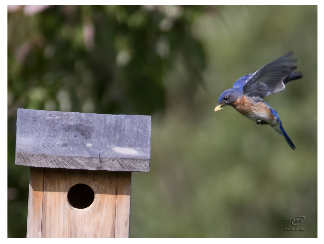
Don't miss our amazing Facebook videos of Eastern Bluebirds nesting!