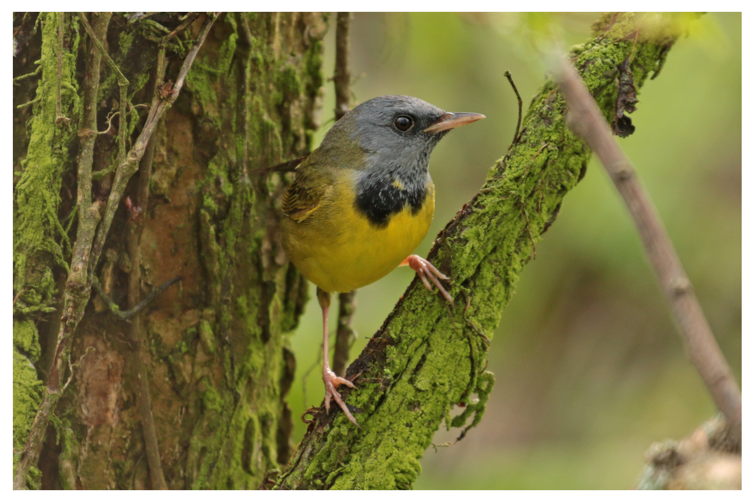
Mourning Warbler

We are pleased to introduce our new edition of the newsletter by Nature Expert. Spring is always a great time for birdwatchers with the return of migrants. Finally, we will be able to fill our feeders without a coat and without stalling in the snow up to our knees! Spring is not only the return of the sparrows but that of the Grand Défi! We invite you to go out birdwatching and if you need to change your binoculars, we have the new Curio from Swarovski in stock. Good reading!