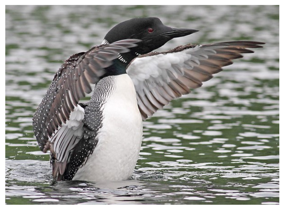
Birdsongs Serge Beaudette