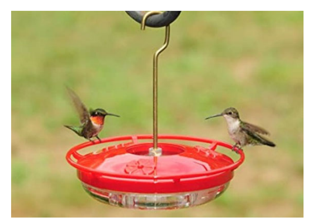
Aspects Mini High View Hummingbird Feeder