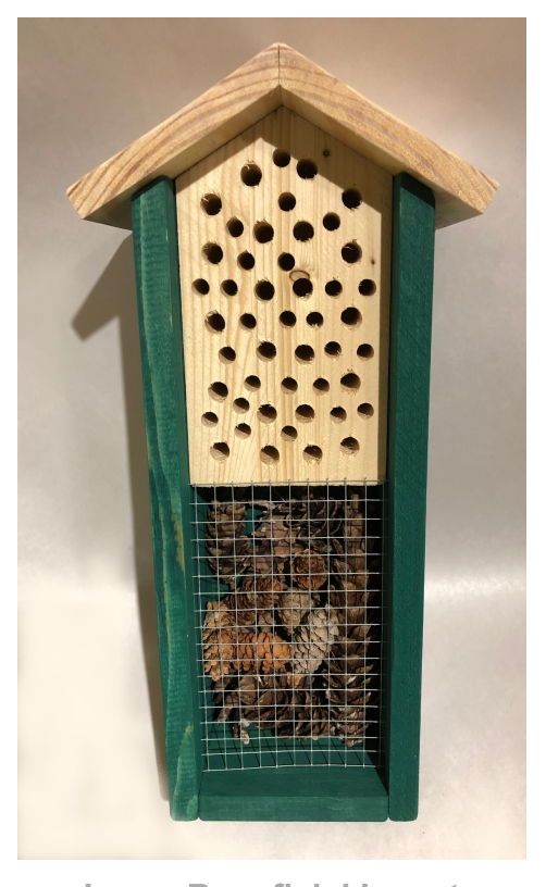
Large Beneficial Insect House

1000 pieces per puzzle Wide variety of themes