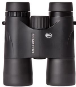
Eagle Optics Ranger

On sale from 299,99$. Up to 70$ off. Models 8X32, 8X42, 10X42, 10X50